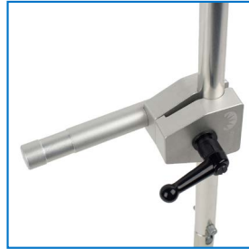
3760 Panel Clamp