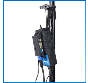
Controller + Power Supply + pouch