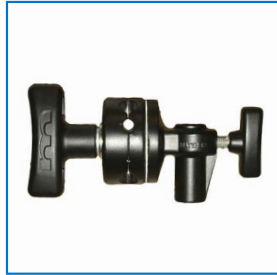
3750 Grip Head