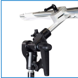
Single Axis Adapter with Panel Clamp