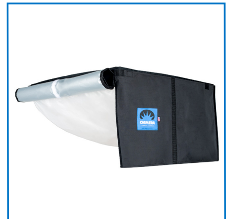
Fabric Lantern and optional Skirt Kit