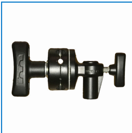
3750 Grip Head