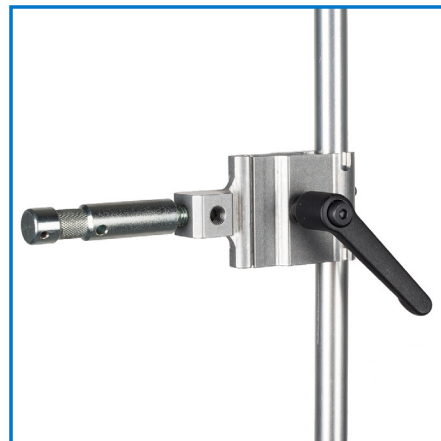
3760 Panel Clamp